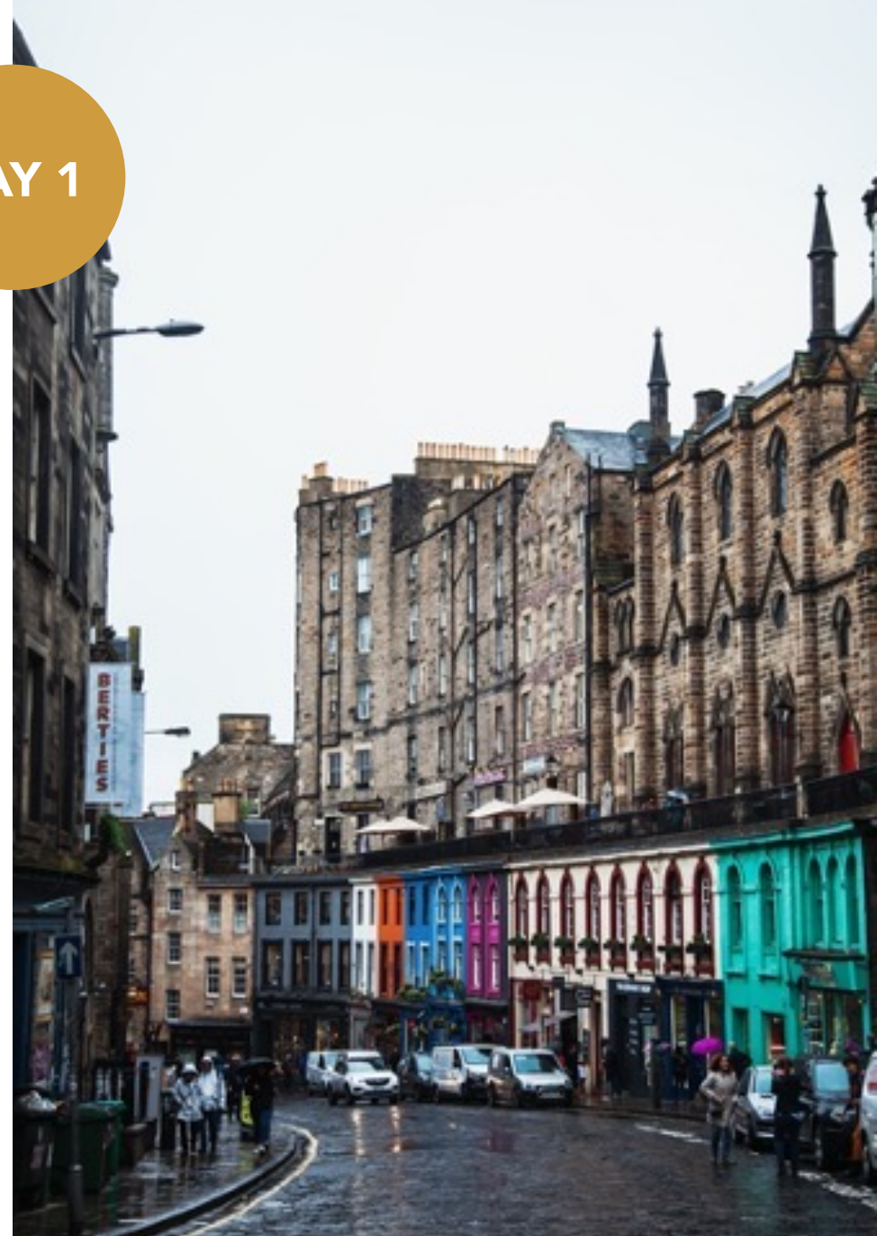
Overnight in Edinburgh