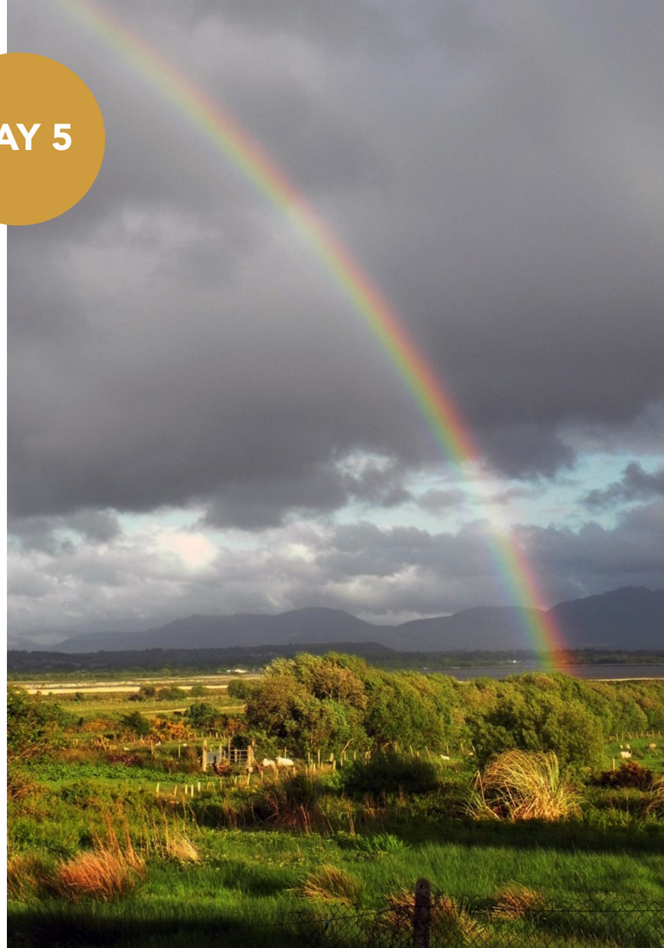
Overnight in Killarney