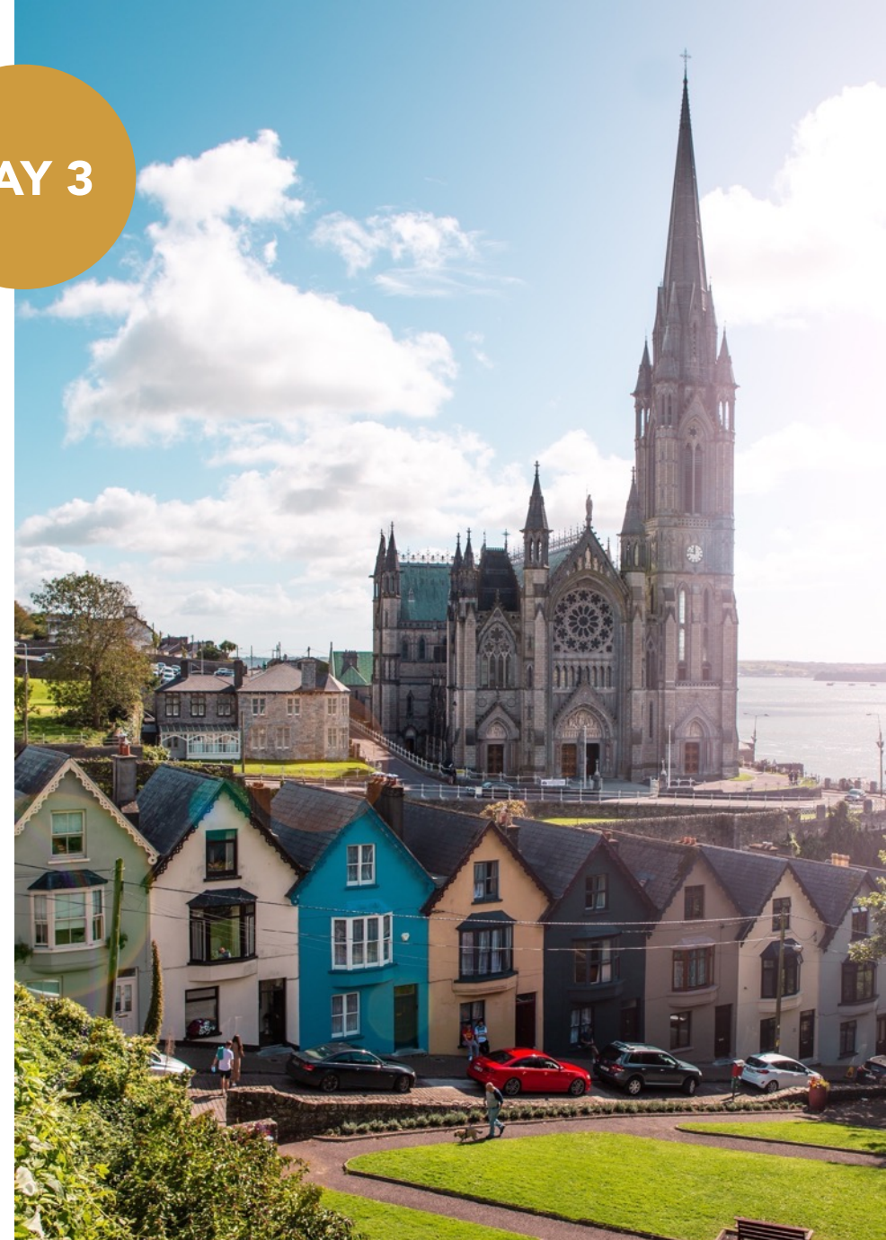
Overnight in Cork